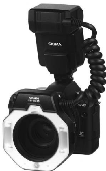
Slika 5. Aparat sa kombinacijom ring blica i blica iz jedne tačke Figure 5. Ring flash of the camera