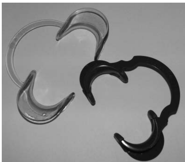
Slika 4. Plastični retraktori Figure 4. Plastics retractors