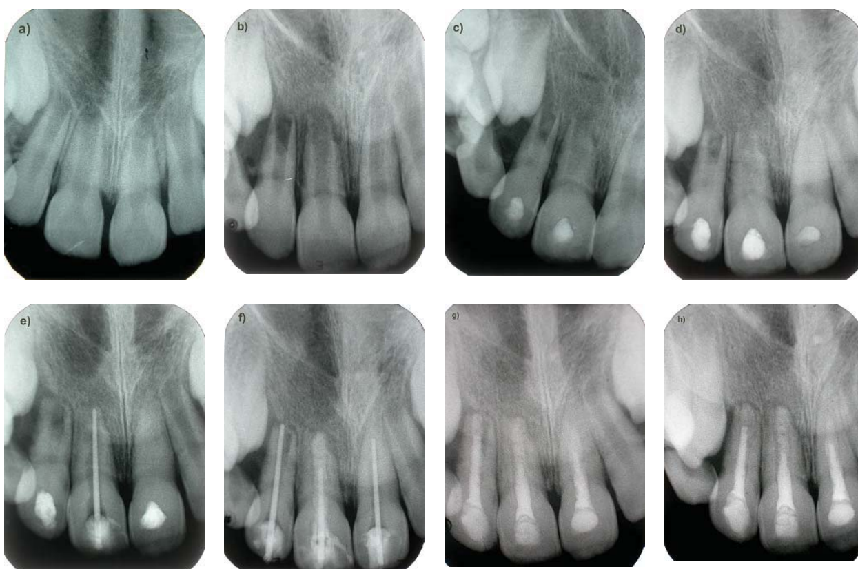
Fig. 1 – a) Radiographic view immediately after trauma; b) Radiographic view after 2 months; c) View after 4 months, calcium hydroxide dressing; d) Radiographic view after 6 months calcium hydroxide dressing; e) Odontometry of the tooth 11; f) Odontometry of the teeth 12, 21; placement of MTA in the apical third of the tooth 11; g) Definitive obturation with MTA, root canal sealer and gutta-percha; h) Radiographic follow-up after 6 months.

central incisor after a month (Figure 1c). During the next 3 months, calcium hydroxide dressing was replaced monthly with the same canal. After 3 months, the same endodontic treatment was initiated on the left central incisor because of the appearance of dentoalveolar abscess (Figure 1d). During the therapy, the odontometry was performed (Figures 1e and f). Six months after the therapy was initiated, the teeth were obturated with MTA in the apical third, and the coronal part of the root canal was filled with a canal sealer and gutta-percha two days after placement of MTA (Figure 1g). After setting the materials, temporary fillings were removed and the coronal restorations were made with a composite material. The teeth were asymptomatic clinically and radiographies did not show pathological changes at the control examinations after one and six months (Figure 1h).