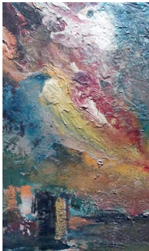
Fig. 1 – Jovan Bijelić. "Tempest over Marinko's Pond" (Oil on canvas, 1955).

Passages from Smail Tihić's 7 "Jovan Bijelić: life and work" are almost the only available source of the artist's wrestling with the eye disease. He was painting even when he barely perceived colors at the palette, while his friends' opinion helped him to get an impression of what he had created 8 (Figure 1).