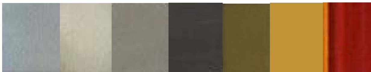
Fig. 5 – Palette used by Kay Sage in her last paintings before cataract surgery.