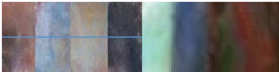
Fig. 3 – Palette from Bijelić's abstract art (1962).