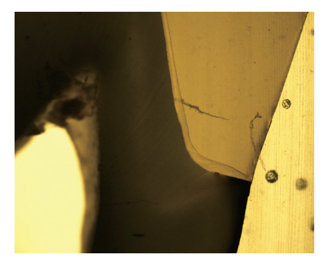
Fig. 5 Representative sample from Group 3 (Control group) with a nanoleakage score of 3 (×6).