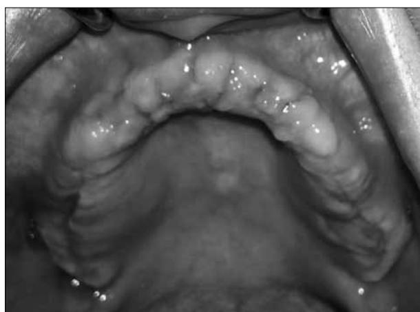
Figure 9. Seventh postoperative day – sutures removed Slika 9. Stanje u ustima pacijentkinje nakon uklanjanja konaca – sedmi postoperacioni dan