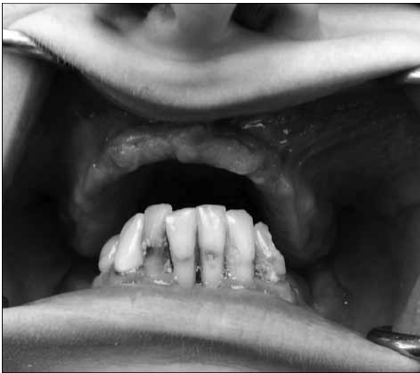
Figure 1. Preoperative situation in patient's mouth Slika 1. Preoperaciono stanje u ustima pacijentkinje