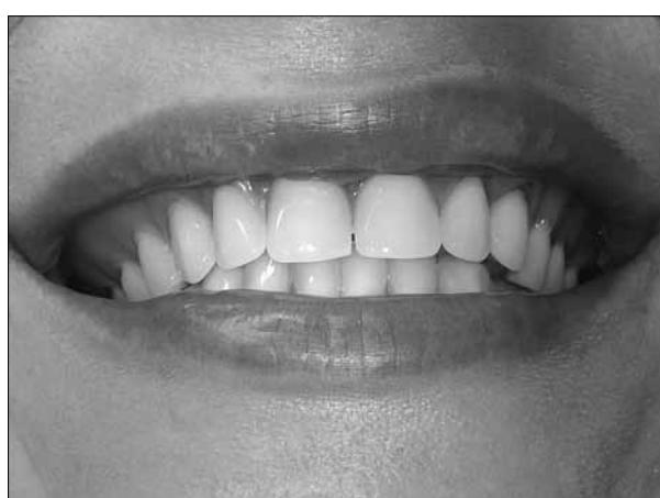
Figure 10. Complete denture rehabilitation – one month after surgery Slika 10. Stanje u ustima pacijentkinje nakon protetičke rehabilitacije mesec dana od operacije

regime recommendation. The follow-up examination was scheduled for one day after.