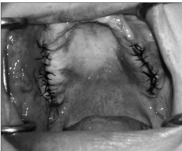
Figure 5. Surgical sutures placed in the posterior part of maxilla Slika 5. Primarno ušivene rane u bočnim segmentima gornje vilice