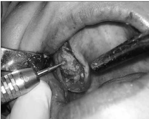
Figure 3. Alveolar osteoplasty of posterior maxillary region (left side) using a diamond bur Slika 3. Uklanjanje koštanog tkiva dijamantskim borerom u gornjoj vilici s leve strane