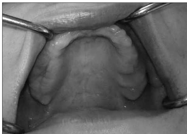
Figure 11. Soft tissue – one month after surgery Slika 11. Stanje mekih tkiva mesec dana nakon operacije

Many authors have investigated biological processes involved in healing process of extraction socket. An ani-