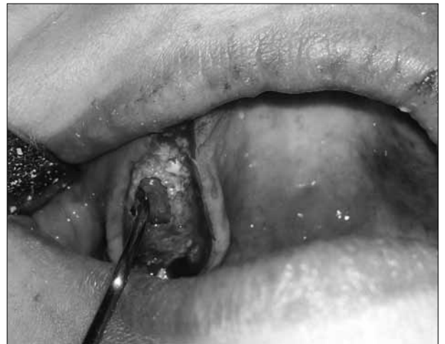
Figure 4. Schneiderian membrane pushing caudally on the left side of maxilla Slika 4. Potiskivanje sluzokože levog maksilarnog sinusa kaudalno