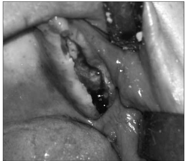
Figure 2. Elliptical incision on the left side of maxilla Slika 2. Elipsasta incizija u gornjoj vilici s leve strane