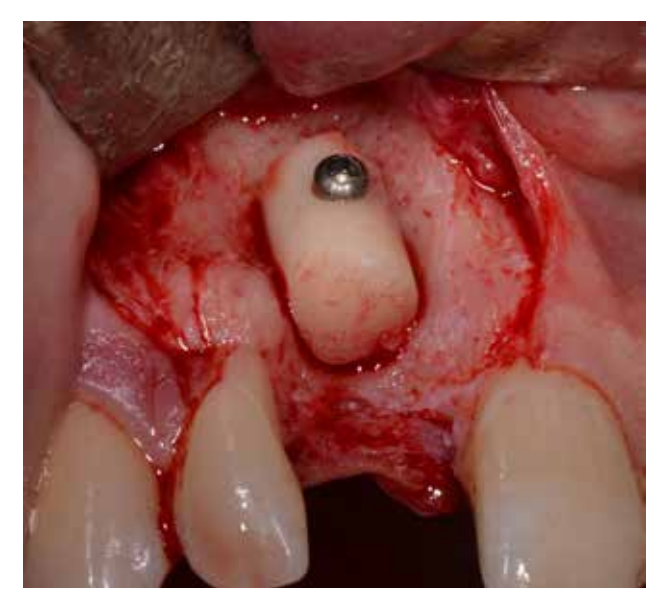
Figure 4a. Staged approach. Bone block harvested from retromolar area and fixed at the recipient site