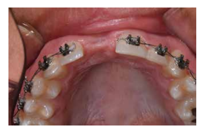
Figure 1a. Type 2 placement. Soft tissue healed allowing the primary tension-free closure following guided bone regeneration procedure

risk. Deviation from this protocol is necessary in cases of large apical bone defects that compromise primary implant stability. In this situation, early implant placement with partial bone healing following 12 to 16 weeks (Type 3) is indicated<sup>2</sup>. Although newly formed bone in the extraction socket supports implant and provides sufficient primary stability, at the same time flattening of the facial bone wall occurs as a result of bone remodelling and requires contour augmentation using bone filler with slow resorption rate for acceptable esthetic result<sup>1,2</sup>.