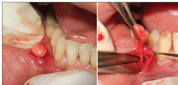
Figure 1. Intraoperative view showing lesion connected to the mental nerve

Slika 1. Intraoperativni nalaz nakon odvajanja od okolnog tkiva. Neurom je peteljkom bio vezan za n. mentalis