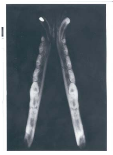
Figure 4. Lower left canine tooth 6 months after initial treatment: the root apex has matured to stage G; dentinal walls are thinner compared to the control tooth