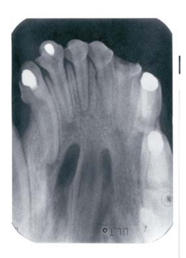
Figure 3. Direct pulp capping with Hap on second and third incisors. Apex growth is completed (stage G). Incomplete dentinal bridges are visible

Beohap powder was applied on pulpal wound after the coronal part of the pulp was removed. Cavities were lined with glassionomer liners and filled with amalgam. As viewed on radiographs, root formation was completed in all tested teeth with the majority of both tested and control teeth being in the development stage "H" and physilogical shapes. Dentin bridge formation was observed in 6 out of 8 tested teeth. There were no significant differences in 4 observed parameters compared to control teeth.