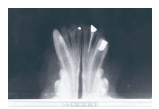
Figure 5. First central inisor after pulp capping: the apex has reached stage G. On the lateral incisor pulpotomy was performed at the point of radiographically visible point of immature root and filled with Silapex and gutapercha; the apex has matured to stage H. Pulpotomy at the e-c junction was performed on the canine; the apex growth has reached stage H