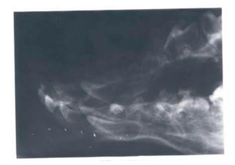
Figures 1a and b. The presence of permanent teeth in different stages of development