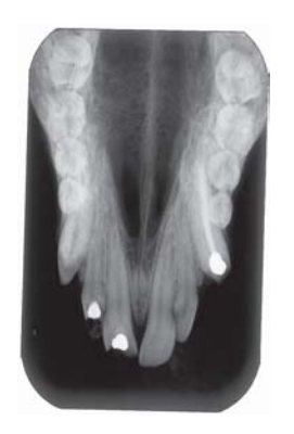
Figure 2. Maxillary right canine (high pulpotomy and HAP application), and right lateral incisor (pulpotomy and HAP application) in stage G of apex formation; right central incisor (given the same treatment as lateral incisor) in stage H of apex formation, 3 months after treatment

No statistically significant difference was found considering radiographically evaluated parameters between teeth given pulpotomy and those given high pulpotomy in both test periods.