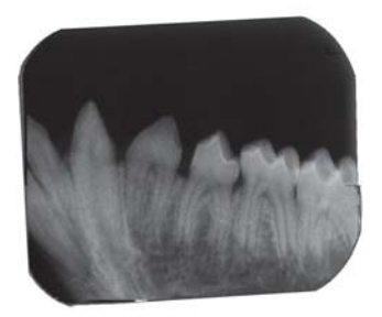
Figure 4. Pre-treatment radiography

Figure 3. Mandibular right incisors and canine (test teeth given pulpotomy and HAP application), and left incisors and canine (control teeth), both reached apex growth stage H 12 months after initial treatment