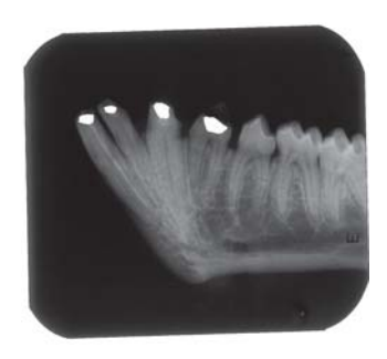
Figure 5. 12 months after initial treatment

Mandibular central incisor after high pulp amputation, HAP application, and canal obturation has reached H stage after 12 months interval (stage G pre treatment). Lateral incisor in stage G 12 months after pulp amputation and HAP application (stage F pre treatment).