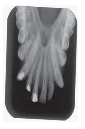
Figure 3. Mandibular right incisors and canine (test teeth given pulpotomy and HAP application), and left incisors and canine (control teeth), both reached apex growth stage H 12 months after initial treatment

Table 6. High pulpotomy with hydroxyapatite application and controls at 3 and 12 months interval