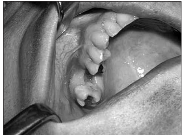
Figure 1. Oroantral fistula localised in the region of the first upper right molar

Immediately before the surgical procedure, the patient received amoxicillin and clavulanic acid (Amoksiklav), 1 g twice daily for 7 days. Modified Caldwell–Luc operation with oral antrostomy was performed under local anaesthesia with Lidocain an epinephrine 2%. A buccal flap was created and sinus was explored through canine