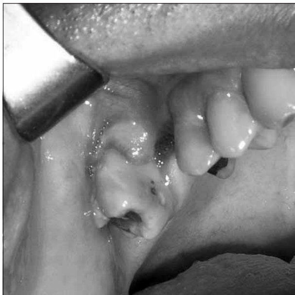
Figure 10. Complete coverage of membrane at the end of second week Slika 10. Potpuno pokrivanje membrane na kraju druge nedelje

in bucco-palatal, and 10 mm in mesio-distal direction (Figure 8). After surgery patient was prescribed nasal decongestants and mouth wash with 0,12 % chlorhexidine-digluconate, twice daily until the end of epithelisation. Gause was shortened on 2 nd , and removed on 4 th day, while sutures were removed on 7 th day after surgery. Postoperative period was uneventfull.