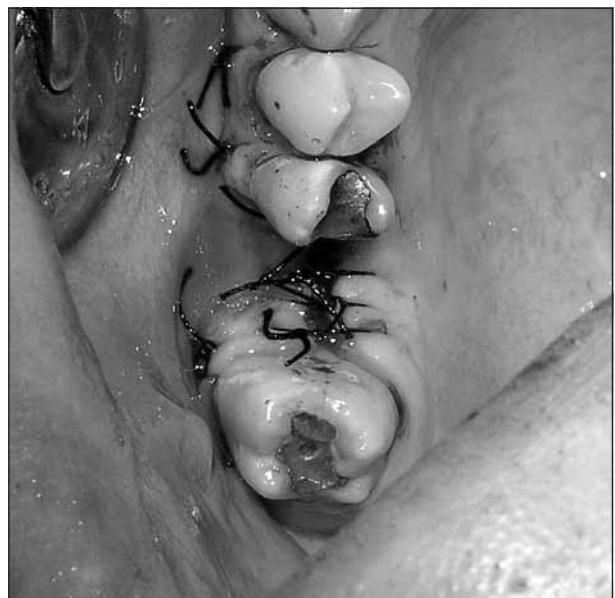
Figure 8. Buccal flap sutured to its original position and exposed membrane Slika 8. Bukalni režanj zašiven na prvobitnu poziciju i izložena membrana