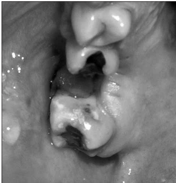
Figure 9. Reduced area of exposed membrane after one week Slika 9. Redukovana oblast izložene membrane posle jedne nedelje

Resorbable collagen membrane ( Bio-Gide ®, Geistlich, Wolhusen, Switzerland ) was placed over bony defect, and its position secured with resorbable pins (Figure 7). Buccal flap was repositioned to its original position without incising the periosteum, and sutured with interrupted sutures (Silk 3-0). Membrane was exposed to the oral cavity 3mm