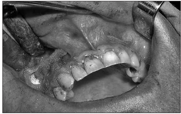
Figure 6. Vestibular drainage with gauze through the submucosal tunnel Slika 6. Vestibularna drenaža gazom kroz submukozni tunel