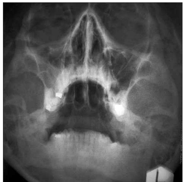
Figure 2. On PA radiogram a soft tissue shadow in the right maxillary sinus indicating chronic sinusitis

Slika 1. Oroantralna fistula lokalizovana u regiji prvog gornjeg desnog molara