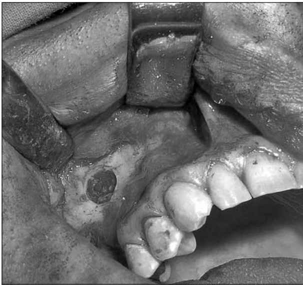
Figure 4. Explored maxillary sinus through the canine fossa approach Slika 4. Otvoreni maksilarni sinus preko canine fossa