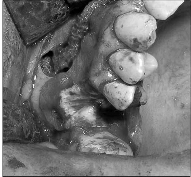
Figure 7. Resorbable membrane placed over bone defect fixed with resorbable pins Slika 7. Resorptivna membrana postavljena preko oštećenja kosti fiksirana resorptivnim klinovima