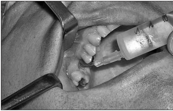
Figure 3. Rinsing of maxillary sinus with physiologic saline Slika 3. Ispiranje maksilarnog sinusa fiziološkim rastvorom natrijum-hlorida