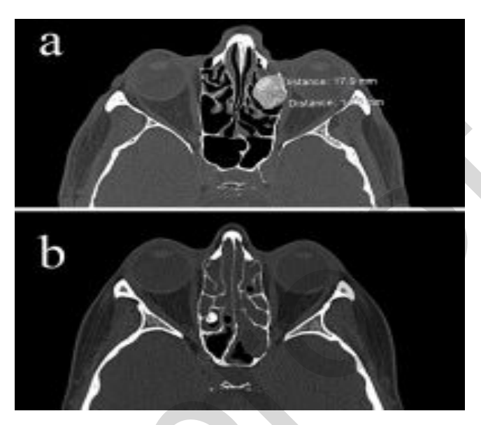
Figure 1. Axial computed tomography scans (bone window) show large osteoma in the left ethmoid sinus (a), and right-sided ethmoid osteoma associated with polyposis (b).

The study was performed on 2,820 patients subjected to CT examination due to suspected sinus disease in the period 2005 - 2011. Radiological examination was performed using Computed Tomography (Siemens Somatom Sensation 16) at the Department of Radiology, Faculty of Dentistry, Belgrade, Serbia.