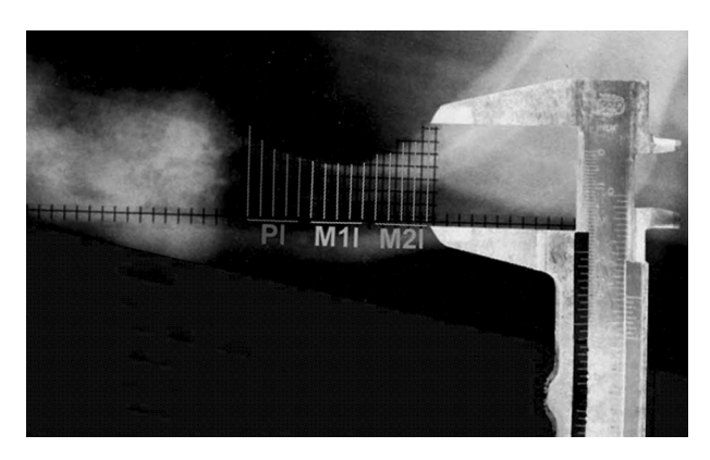
Figure 1. Segments of interest in mandible