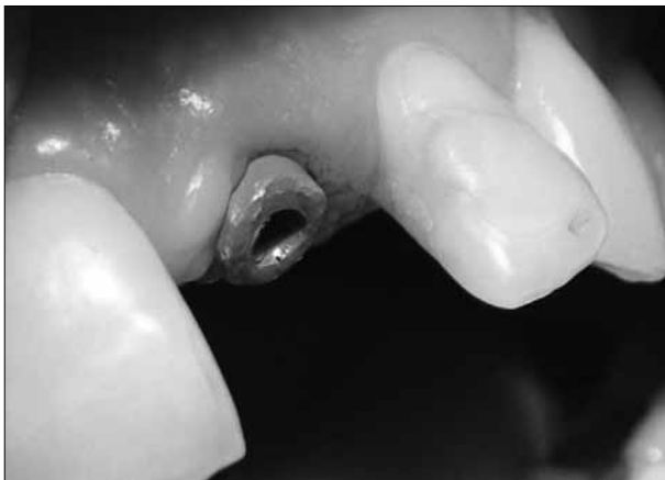
Figure 2. Customizable healing cap placed

Slika 1. Okrugao i isuviše uzan izgled izlaznog profila 15 dana posle otvaranja implantata