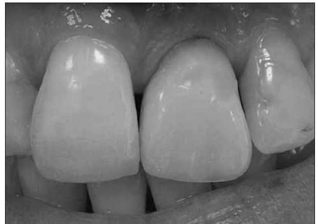
Figure 6. Emergence profile with provisional restoration 90 days later

Slika 5. Oblikovanje izlaznog profila privremenom nadoknadom uz periodično dodavanje kompozitnog materijala