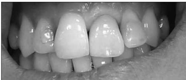
Figure 4. Insertion of implant-supported screw-retained provisional restoration. Ischemic reaction is visible

Slika 3. Izgled mekog tkiva 30 dana po uklanjanju prilagodljive kapice za zarastanje