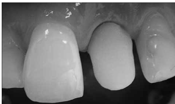
Figure 8. The IPS e.max Press hybrid abutment made of lithium disilicate on the titanium base (Ti base, Straumann)

Slika 7. Postavljen individualizovani transfer pozicije implantata za otisak metodom otvorene kašike