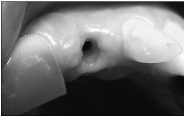
Figure 1. Narrow and round appearance of emergence profile after 15 days

Slika 1. Okrugao i isuviše uzan izgled izlaznog profila 15 dana posle otvaranja implantata