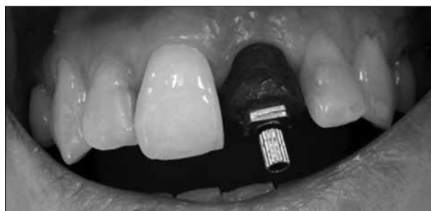
Figure 7. Customized impression coping for the open tray technique

Slika 7. Postavljen individualizovani transfer pozicije implantata za otisak metodom otvorene kašike