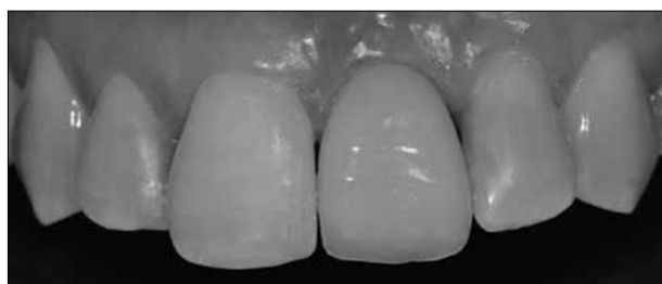
Figure 9. Final all-ceramic screw retained single crown in situ

Slika 8. IPS e.max Press hibridni abatment od litijum-disilikata na bazi titanijuma (Ti base, Straumann)