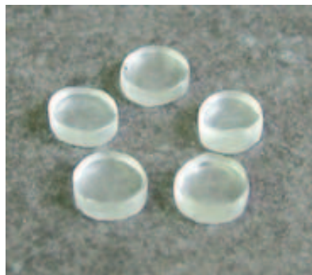
Fig. 1 – Analyzed samples.

moved and the tubes were again filled with fresh solution. All extracts were filtered off before working for sterilization purposes. During the ADT, the contact between cell lines and material samples was conducted direct, while during the MTT test it was done through eluates (extracts).